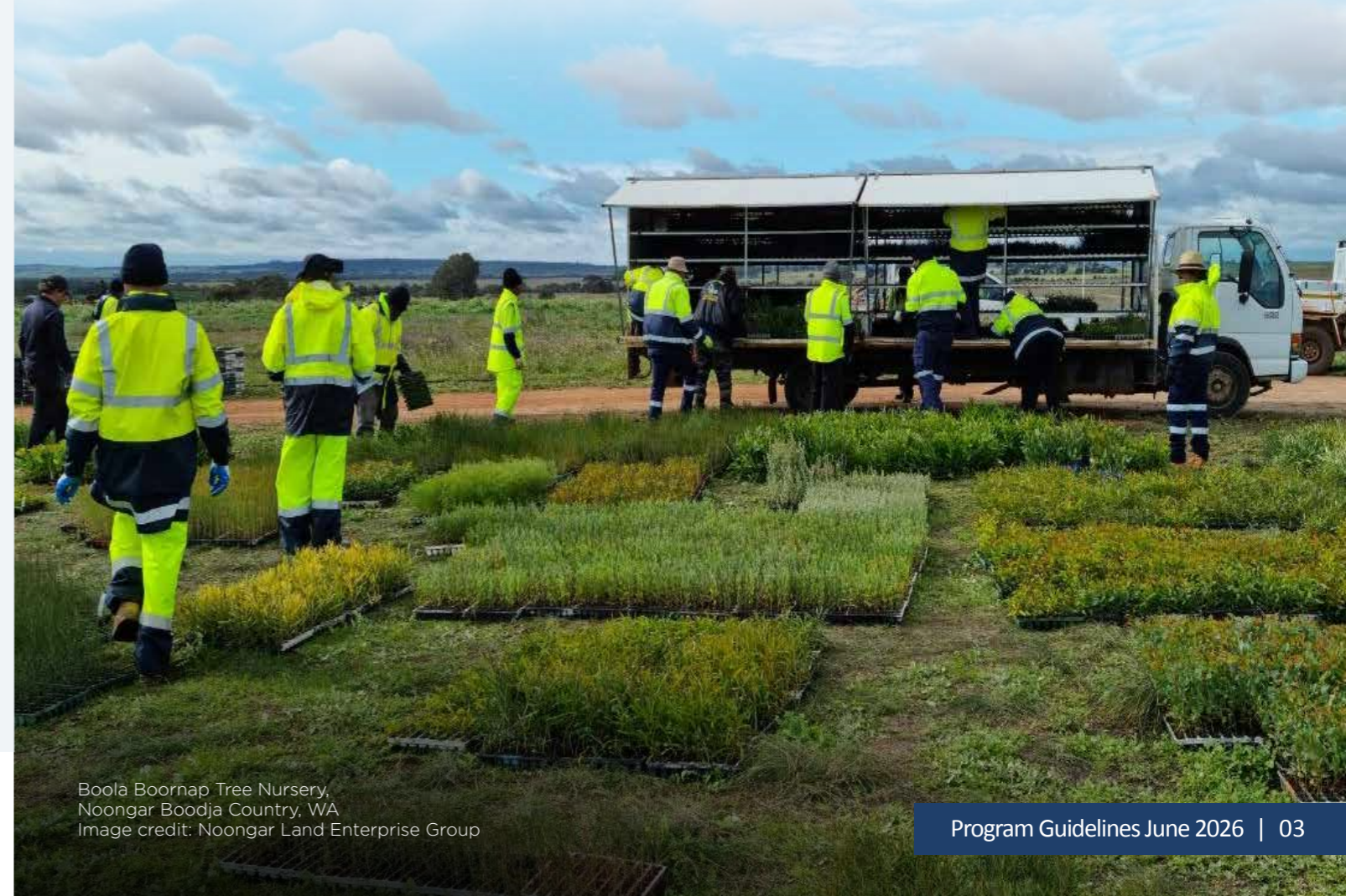
Boola Boornap Tree Nursery, Noongar Boodja Country, WA

Read on for the application steps, eligibility criteria and full guidelines