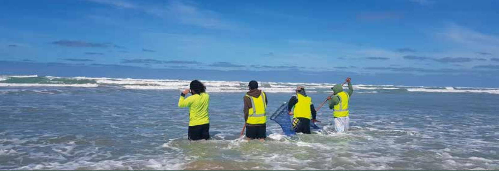
Pipi harvesting on Ngarrindjeri country, Coorong SA.